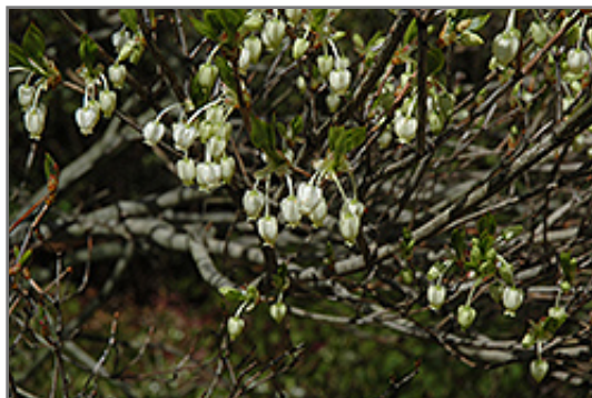
J.L. Pennock White Enkianthus flowers