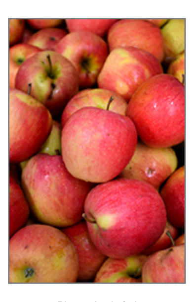
Pinova Apple fruit