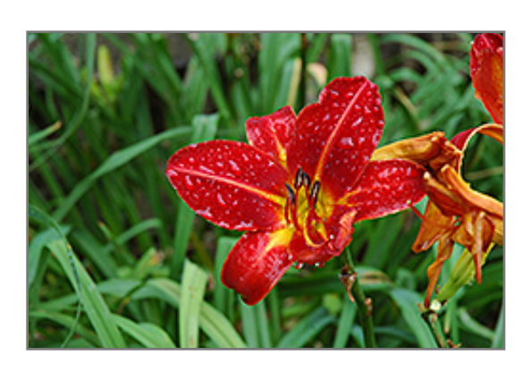
Allegiance Daylily flowers

Stunning crimson red flowers with yellow throat and veins bloom early in the season, adding a pop of color to perennial borders, beds and containers; excellent heat and drought tolerance; low maintenance and easy to grow