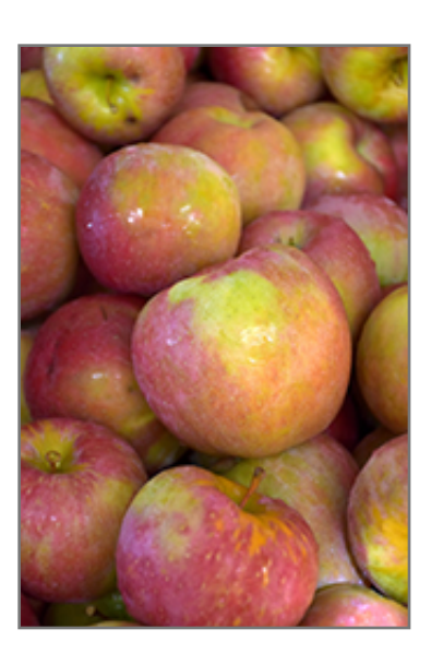
Evercrisp Apple fruit