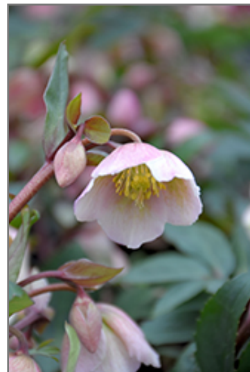
Winterbells Hellebore flowers