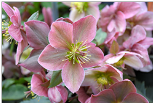
Gold Collection Platinum Rose Hellebore flowers

Gold Collection Platinum Rose Hellebore is recommended for the following landscape applications;