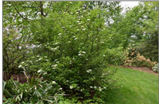
Emerald Charm Rusty Blackhaw in bloom