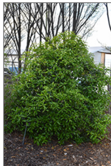
Apricot Gold Fragrant Tea Olive