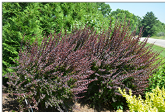
Sunjoy Syrah Japanese Barberry

Sunjoy Syrah Japanese Barberry is recommended for the following landscape applications;