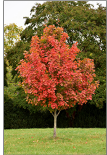
John Pair Sugar Maple in fall