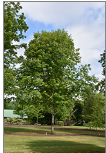
John Pair Sugar Maple