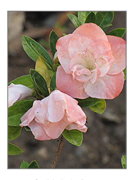
Starlight Azalea flowers

When grown indoors, Starlight Azalea can be expected to grow to be about 3 feet tall at maturity, with a spread of 3 feet. It grows at a slow rate, and under ideal conditions can be expected to live for approximately 40 years. This houseplant will do well in a location that gets either direct or indirect sunlight, although it will usually require a more brightly-lit environment than what artificial indoor lighting alone can provide. It requires an evenly moist well-drained soil for optimal growth, but will suffer if left to grow in standing water. The surface of the soil shouldn't be allowed to dry out completely, and so you should expect to water this plant once and possibly even twice each week. Be aware that your particular watering schedule may vary depending on its location in the room, the pot size, plant size and other conditions; if in doubt, ask one of our experts in the store for advice. It is very fussy about its soil conditions and must be grown in rich, acidic soil to ensure success. Contact the store for specific recommendations on pre-mixed potting soil for this plant.