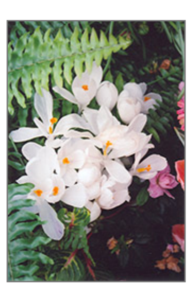
Jean D'Arc Crocus flowers

When grown indoors, Jean D'Arc Crocus can be expected to grow to be only 3 inches tall at maturity, with a spread of 4 inches. It grows at a slow rate, and under ideal conditions can be expected to live for approximately 5 years. This houseplant requires direct sun for optimal performance, and should therefore be situated in a room that gets bright sunlight for a good part of the day; it is not a good choice for rooms lit only by artificial light. It does best in average to evenly moist soil, but will not tolerate standing water. The surface of the soil shouldn't be allowed to dry out completely, and so you should expect to water this plant once and possibly even twice each week. Be aware that your particular watering schedule may vary depending on its location in the room, the pot size, plant size and other conditions; if in doubt, ask one of our experts in the store for advice. It is not particular as to soil type or pH; an average potting soil should work just fine.