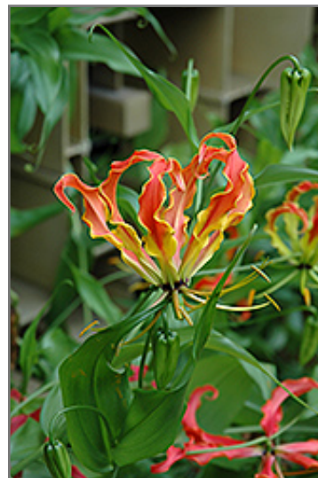
Gloriosa Lily flowers

This is a multi-stemmed houseplant with a spreading, ground-hugging habit of growth. This plant may benefit from an occasional pruning to look its best.