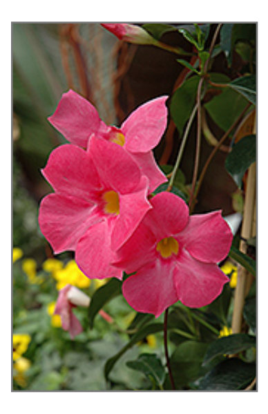
Sun Parasol Pretty Pink Mandevilla flowers

When grown indoors, Sun Parasol Pretty Pink Mandevilla can be expected to grow to be about 10 feet tall at maturity, with a spread of 24 inches. It grows at a medium rate, and under ideal conditions can be expected to live for approximately 20 years. This houseplant will do well in a location that gets either direct or indirect sunlight, although it will usually require a more brightly-lit environment than what artificial indoor lighting alone can provide. It requires an evenly moist well-drained soil for optimal growth. The surface of the soil shouldn't be allowed to dry out completely, and so you should expect to water this plant once and possibly even twice each week. Be aware that your particular watering schedule may vary depending on its location in the room, the pot size, plant size and other conditions; if in doubt, ask one of our experts in the store for advice. It is not particular as to soil type or pH; an average potting soil should work just fine. Be warned that parts of this plant are known to be toxic to humans and animals, so special care should be exercised if growing it around children and pets.