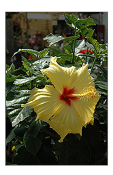
Hula Girl Hibiscus flowers

When grown indoors, Hula Girl Hibiscus can be expected to grow to be about 5 feet tall at maturity, with a spread of 4 feet. It grows at a fast rate, and under ideal conditions can be expected to live for approximately 5 years. This houseplant will do well in a location that gets either direct or indirect sunlight, although it will usually require a more brightly-lit environment than what artificial indoor lighting alone can provide. It requires an evenly moist well-drained soil for optimal growth, but will suffer if left to grow in standing water. The surface of the soil shouldn't be allowed to dry out completely, and so you should expect to water this plant once and possibly even twice each week. Be aware that your particular watering schedule may vary depending on its location in the room, the pot size, plant size and other conditions; if in doubt, ask one of our experts in the store for advice. It is not particular as to soil type or pH; an average potting soil should work just fine.