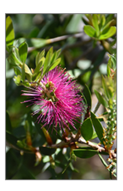
Jeffers Bottlebrush flowers

When grown indoors, Jeffers Bottlebrush can be expected to grow to be about 4 feet tall at maturity, with a spread of 3 feet. It grows at a medium rate, and under ideal conditions can be expected to live for approximately 30 years. This houseplant will do well in a location that gets either direct or indirect sunlight, although it will usually require a more brightly-lit environment than what artificial indoor lighting alone can provide. It prefers to grow in average to moist soil. The surface of the soil shouldn't be allowed to dry out completely, and so you should expect to water this plant once and possibly even twice each week. Be aware that your particular watering schedule may vary depending on its location in the room, the pot size, plant size and other conditions; if in doubt, ask one of our experts in the store for advice. It is not particular as to soil type or pH; an average potting soil should work just fine.