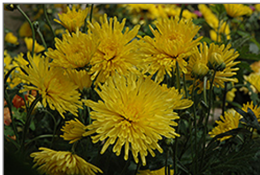
Suncatcher Chrysanthemum flowers

Suncatcher Chrysanthemum is recommended for the following landscape applications;