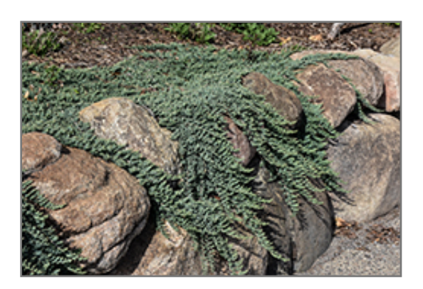
Creeping Juniper