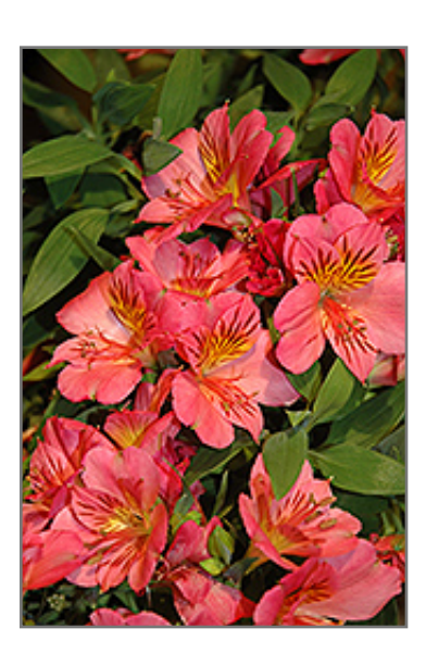
Eliane Princess Lilies Alstroemeria flowers

When grown indoors, Eliane Princess Lilies Alstroemeria can be expected to grow to be about 10 inches tall at maturity, with a spread of 12 inches. It grows at a medium rate, and under ideal conditions can be expected to live for approximately 5 years. This houseplant will do well in a location that gets either direct or indirect sunlight, although it will usually require a more brightly-lit environment than what artificial indoor lighting alone can provide. It does best in average to evenly moist soil, but will not tolerate standing water. The surface of the soil shouldn't be allowed to dry out completely, and so you should expect to water this plant once and possibly even twice each week. Be aware that your particular watering schedule may vary depending on its location in the room, the pot size, plant size and other conditions; if in doubt, ask one of our experts in the store for advice. It is not particular as to soil type or pH; an average potting soil should work just fine.