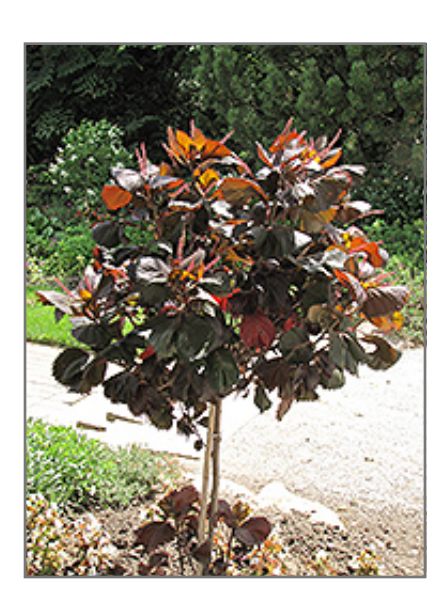
Moorea Copper Plant

When grown indoors, Moorea Copper Plant can be expected to grow to be about 4 feet tall at maturity, with a spread of 3 feet. It grows at a fast rate, and under ideal conditions can be expected to live for approximately 30 years. This houseplant will do well in a location that gets either direct or indirect sunlight, although it will usually require a more brightly-lit environment than what artificial indoor lighting alone can provide. It prefers to grow in average to moist soil. The surface of the soil shouldn't be allowed to dry out completely, and so you should expect to water this plant once and possibly even twice each week. Be aware that your particular watering schedule may vary depending on its location in the room, the pot size, plant size and other conditions; if in doubt, ask one of our experts in the store for advice. It is not particular as to soil pH, but grows best in rich soil. Contact the store for specific recommendations on pre-mixed potting soil for this plant. Be warned that parts of this plant are known to be toxic to humans and animals, so special care should be exercised if growing it around children and pets.