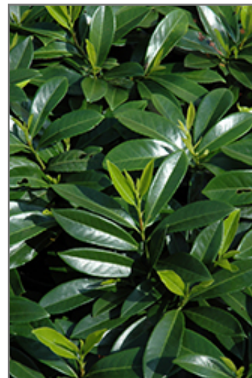
Mount Vernon Laurel foliage