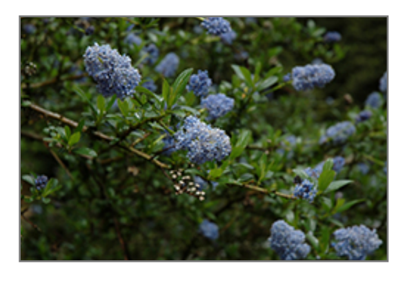
Italian Skies California Lilac flowers

Italian Skies California Lilac is a dense multi-stemmed evergreen shrub with an upright spreading habit of growth. Its average texture blends into the landscape, but can be balanced by one or two finer or coarser trees or shrubs for an effective composition.