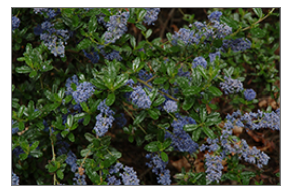
Tilden Park California Lilac flowers