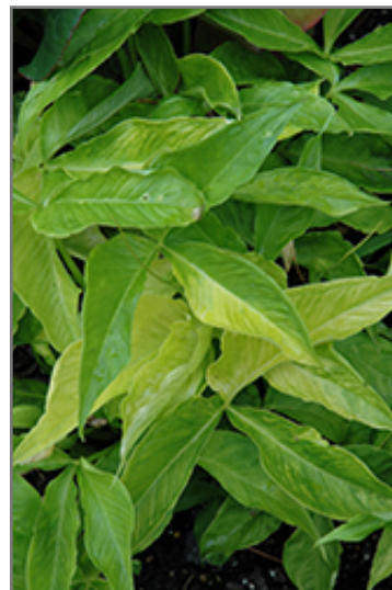
Dragon Tails Green Dragon foliage

Dragon Tails Green Dragon is a fine choice for the garden, but it is also a good selection for planting in outdoor pots and containers. It is often used as a 'filler' in the 'spiller-thriller-filler' container combination, providing a mass of flowers and foliage against which the larger thriller plants stand out. Note that when growing plants in outdoor containers and baskets, they may require more frequent waterings than they would in the yard or garden.