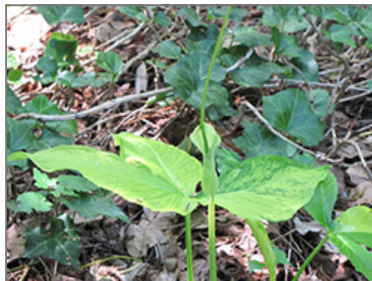
Dragon Tails Green Dragon flowers