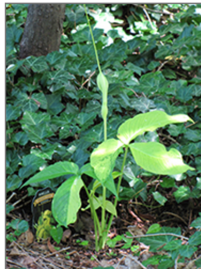
Dragon Tails Green Dragon

Dragon Tails Green Dragon is an herbaceous perennial with an upright spreading habit of growth. Its medium texture blends into the garden, but can always be balanced by a couple of finer or coarser plants for an effective composition.