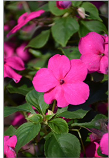
Lollipop Pomegranate Carmine Impatiens flowers

Lollipop Pomegranate Carmine Impatiens is recommended for the following landscape applications;