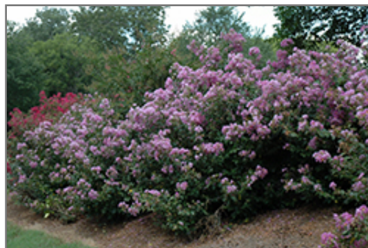
Cordon Bleu Crapemyrtle in bloom