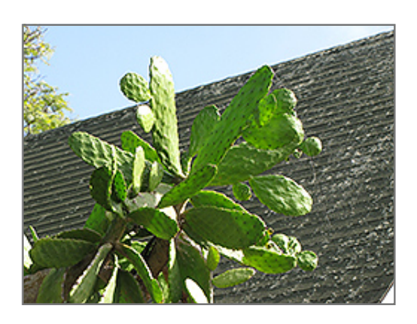
Road Kill Cactus foliage

Road Kill Cactus is a member of the cactus family, which are grown primarily for their characteristic shapes, their interesting features and textures, and their high tolerance for hot, dry growing environments. As an 'opuntiad' type of cactus, it doesn't actually have leaves, but rather modified succulent stems that comprise the bulk of the plant, and which are designed to retain water for long periods of time. This particular cactus is valued for its upright and spreading habit of growth on a plant consisting of spiny emerald green segmented pads that form 'branches' which spread out from a central base. This plant has yellow cup-shaped flowers at the ends of the branches in early summer, which are interesting on close inspection. It features an abundance of magnificent red berries from early to late fall.