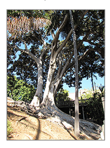
Lord Howe Island Banyan