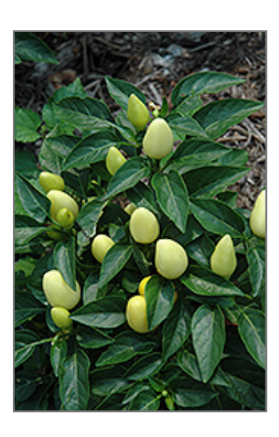
NuMex Memorial Day Ornamental Pepper fruit

NuMex Memorial Day Ornamental Pepper is an herbaceous annual with an upright spreading habit of growth. Its medium texture blends into the garden, but can always be balanced by a couple of finer or coarser plants for an effective composition.