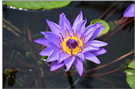
Director George T. Moore Tropical Water Lily flowers

Director George T. Moore Tropical Water Lily is ideally suited for growing in a pond, water garden or patio water container, and is recommended for the following landscape applications;