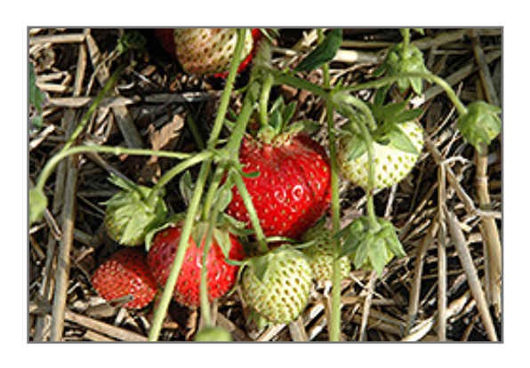
Titan Strawberry fruit

Titan Strawberry features dainty white cup-shaped flowers with lemon yellow eyes along the stems from mid to late spring. Its serrated round compound leaves remain dark green in color throughout the season. It features an abundance of magnificent red berries from late spring to early summer.