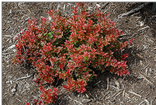
Lutin Rouge Japanese Barberry

Lutin Rouge Japanese Barberry is recommended for the following landscape applications;