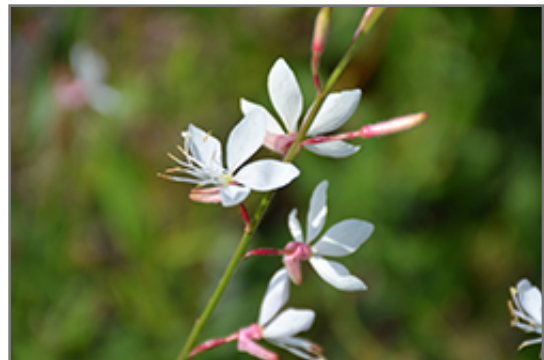
Sparkle White Gaura flowers