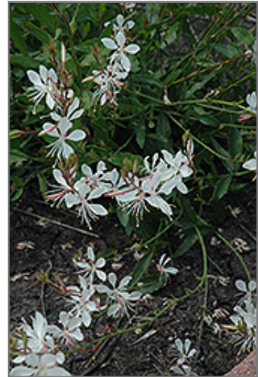
Sparkle White Gaura flowers

This is a relatively low maintenance plant, and is best cleaned up in early spring before it resumes active growth for the season. It is a good choice for attracting butterflies to your yard, but is not particularly attractive to deer who tend to leave it alone in favor of tastier treats. It has no significant negative characteristics.