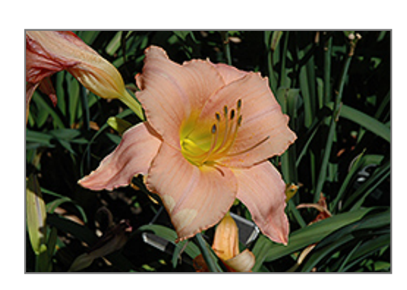
First Waltz Daylily flowers

Large pink trumpets with lemon yellow throats and lightly ruffled edges; great grassy texture and form; tetraploid; a tremendous color addition to the garden or border