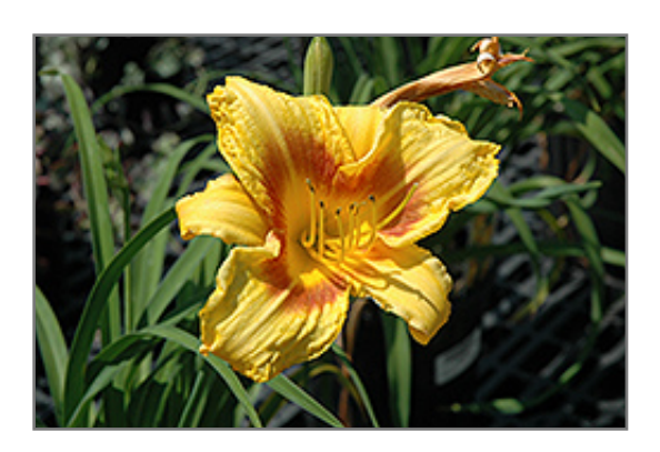
Bumble Bee Daylily flowers