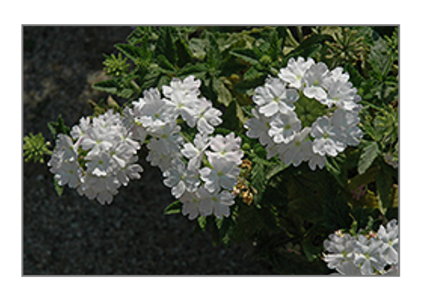
Vegas Plus White Verbena flowers