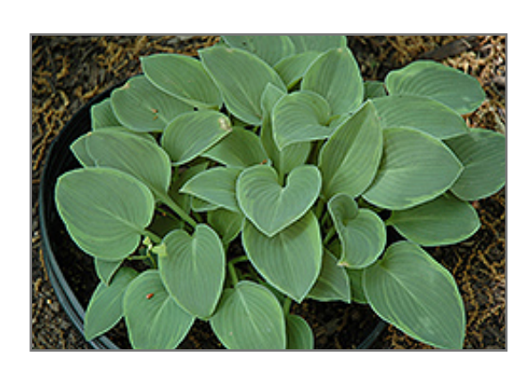
Toy Soldier Hosta