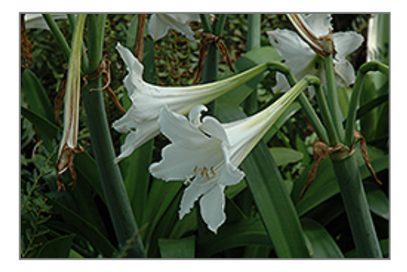
Amputo Amaryllis flowers