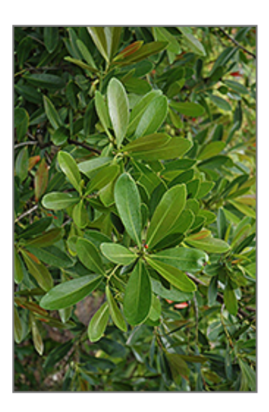
Fried Egg Tree foliage