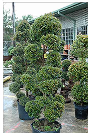
Brush Cherry

Brush Cherry is recommended for the following landscape applications;