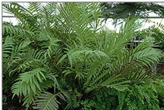
Oriental Fern