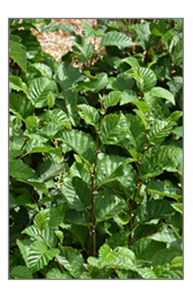
Mountain Alder foliage