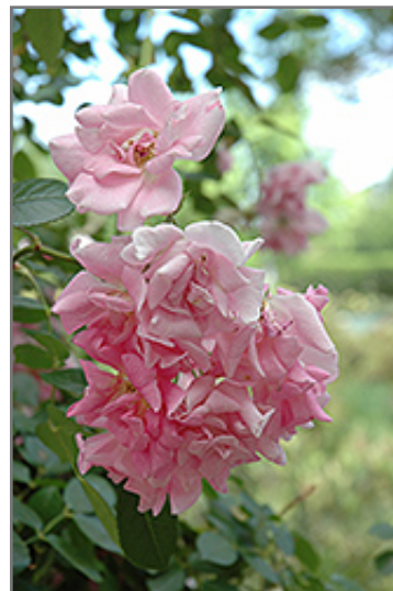
Climbing Pinkie Rose flowers

Climbing Pinkie Rose is recommended for the following landscape applications;