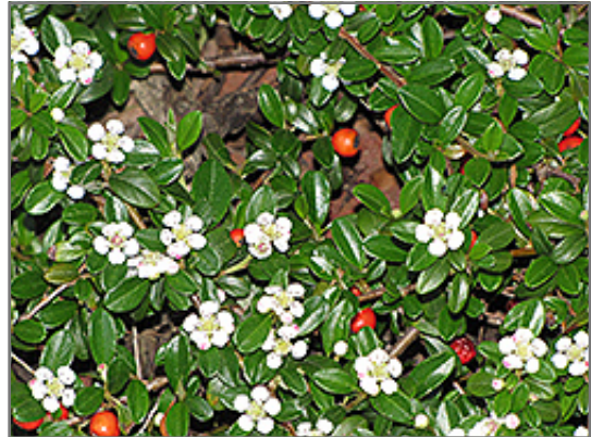
Coral Beauty Cotoneaster fruit

This shrub does best in full sun to partial shade. It is very adaptable to both dry and moist growing conditions, but will not tolerate any standing water. It is not particular as to soil pH, but grows best in rich soils, and is able to handle environmental salt. It is highly tolerant of urban pollution and will even thrive in inner city environments. This is a selected variety of a species not originally from North America.