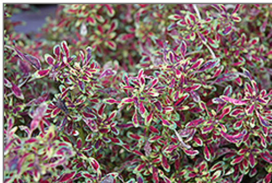
Tiny Toes Coleus foliage

Tiny Toes Coleus will grow to be about 10 inches tall at maturity, with a spread of 12 inches. When grown in masses or used as a bedding plant, individual plants should be spaced approximately 10 inches apart. Although it's not a true annual, this fast-growing plant can be expected to behave as an annual in our climate if left outdoors over the winter, usually needing replacement the following year. As such, gardeners should take into consideration that it will perform differently than it would in its native habitat.