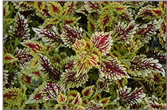
Shocker Coleus foliage

Shocker Coleus will grow to be about 24 inches tall at maturity, with a spread of 28 inches. When grown in masses or used as a bedding plant, individual plants should be spaced approximately 22 inches apart. Although it's not a true annual, this fast-growing plant can be expected to behave as an annual in our climate if left outdoors over the winter, usually needing replacement the following year. As such, gardeners should take into consideration that it will perform differently than it would in its native habitat.