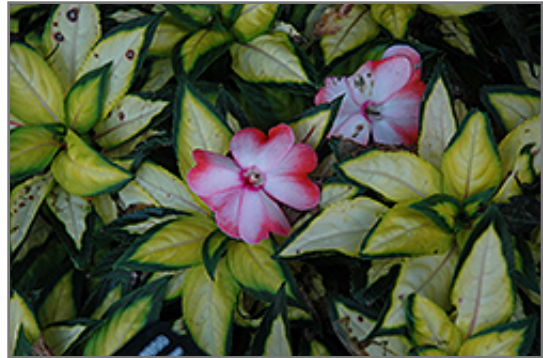
Strike Salmon New Guinea Impatiens flowers

Strike Salmon New Guinea Impatiens is recommended for the following landscape applications;