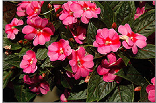
Harmony Marshmallow Cream New Guinea Impatiens flowers

Harmony Marshmallow Cream New Guinea Impatiens is recommended for the following landscape applications;