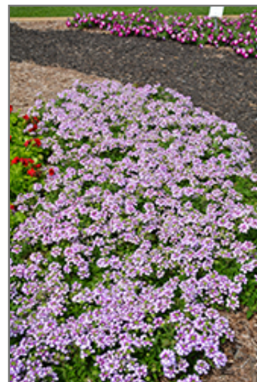
Lanai Twister Purple Verbena in bloom