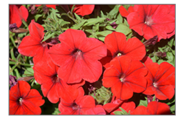
Fortunia Red Petunia flowers